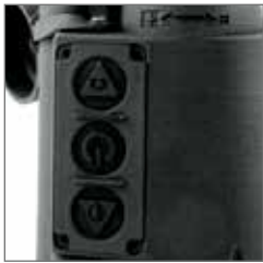
Advanced recording capabilities