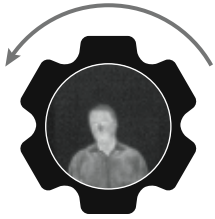
rotate lens counterclockwise for 8x view