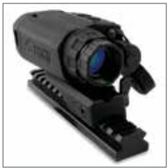
Quick-release Picatinny mount