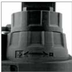
Rotate front lens for continuous 3-8x Zoom